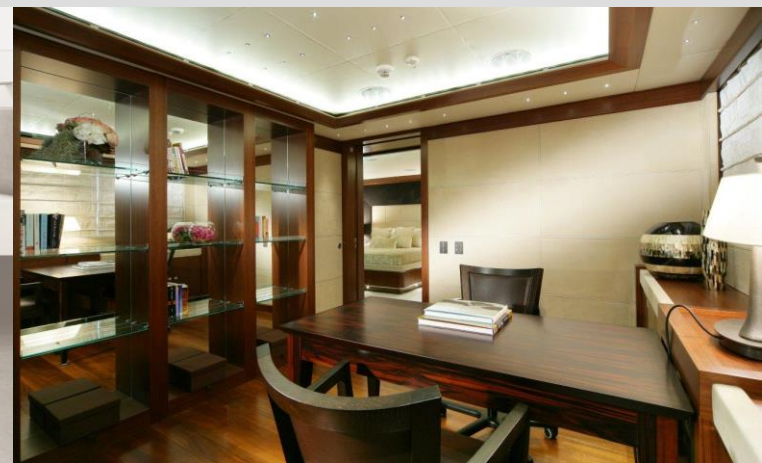
Master cabin with emperor size bed, study and private balcony.