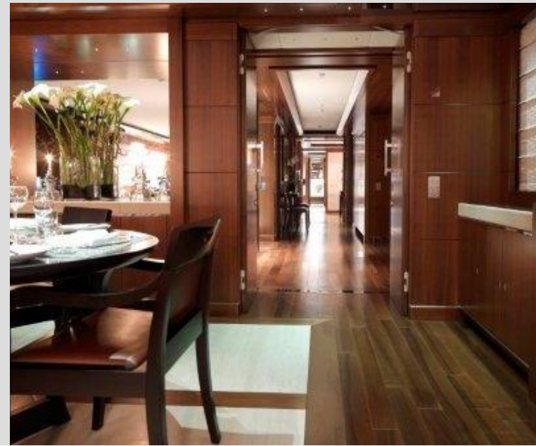
Main deck dining area.